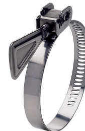
ALSI Worm Drive Clamp F with Wing Screw