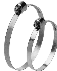
MINI Type R+S with cylindrical screw head, preassembled