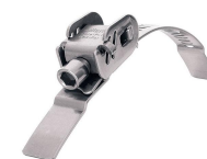
Two-Piece ALSI Worm Drive Clamp