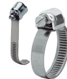
MINI Type R - supplied open or closed, with cylindrical screw head or hexagon head screw