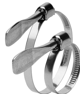
MINI Type R+S with integral wing, preassembled