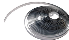
ALSI Universal Clamp Band