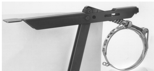
Spring Clamp Compression Tool