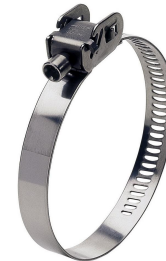
ALSI Worm Drive Clamp

Please contact an OETIKER representative who would be pleased to provide you with technical information regarding our PG 180 clamps. They will also be able to assist you with your application and quantity needs.