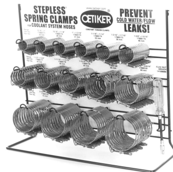
Spring Clamp Rack